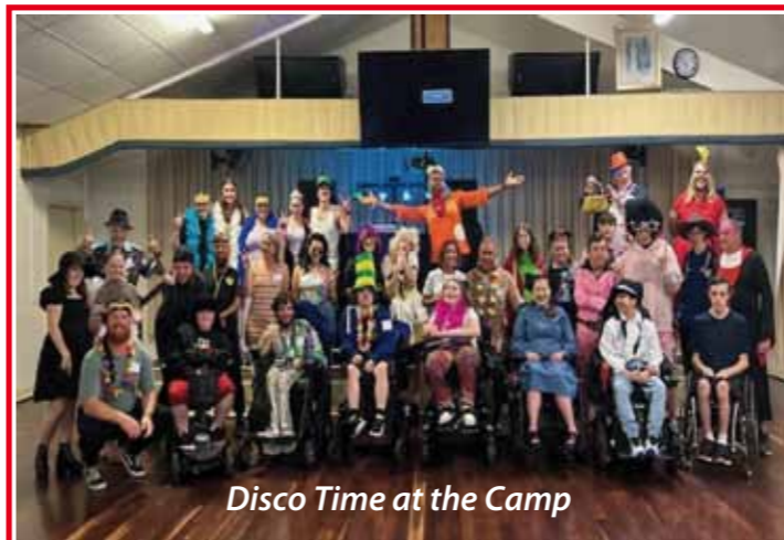
Disco Time at the Camp