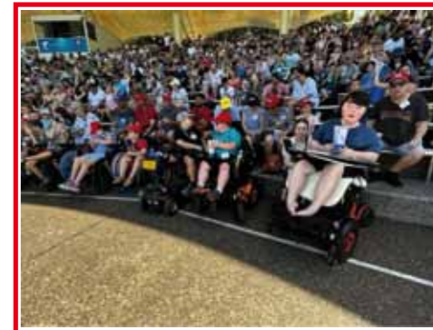
February Campers Enjoying The Seaworld Show