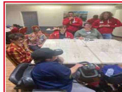
Where's Our Lunch!