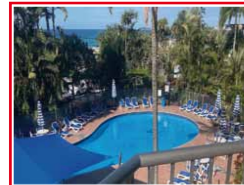
The Pool at Camp Headquarters, The Rocks Resort Currumbin