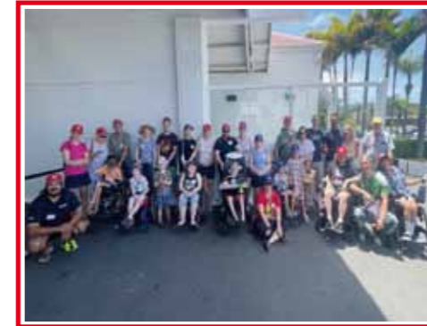
November Family Camp At Seaworld