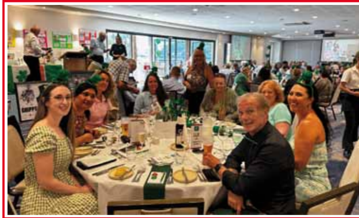
Luncheon Guests Enjoying a Great Afternoon at the Currumbin RSL Club