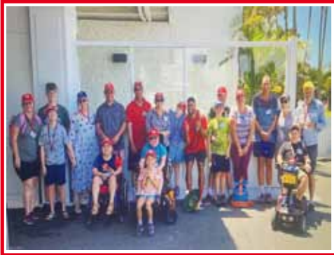
February Family Camp at Seaworld