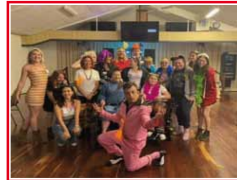
Bring On The Disco Music