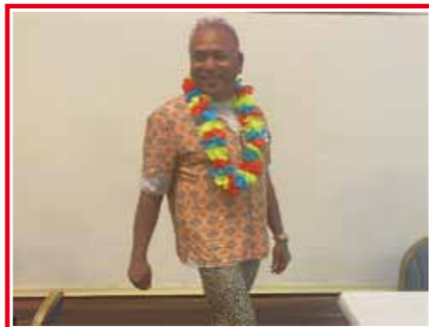
Les Biles Loves to Dress Up!