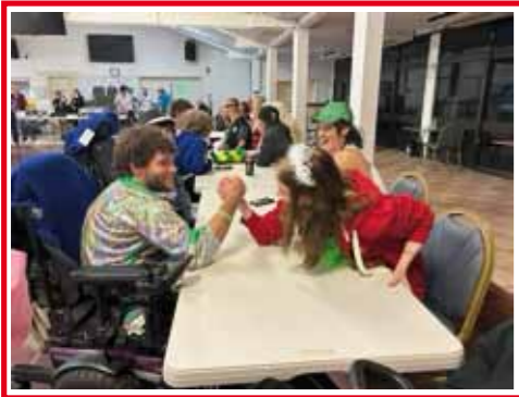
Darcy Arm Wrestle