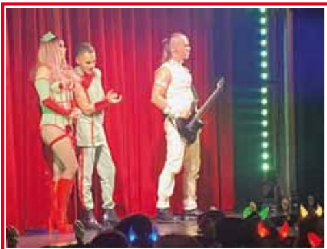
Draculas Always A Popular Night Out