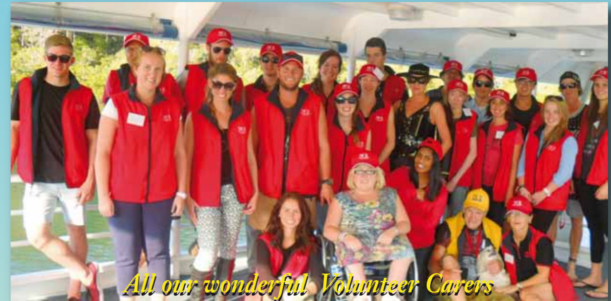
All our wonderful Volunteer Carers