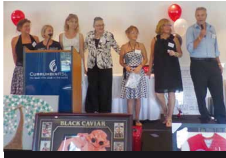
TAC-Q Committee 2014: